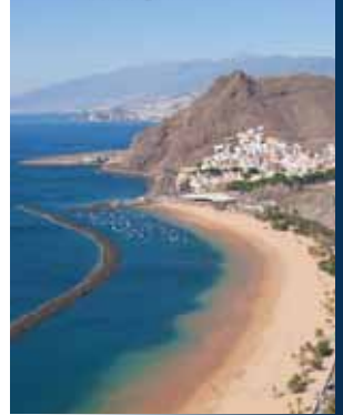
Santa Cruz, Tenerife