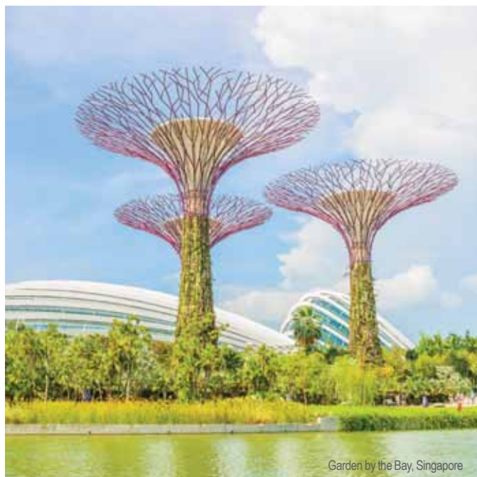
Garden by the Bay, Singapore

Itinerary is based on 28 th March 2018 departure