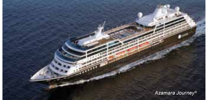
Azamara Journey ®