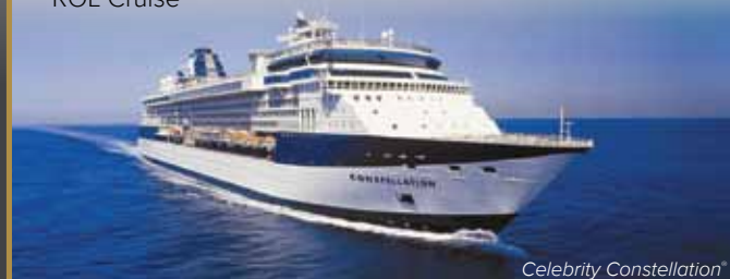
Celebrity Constellation ®