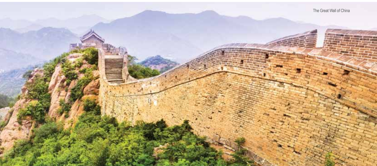
The Great Wall of China