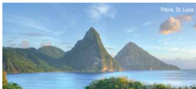
Pitons, St. Lucia